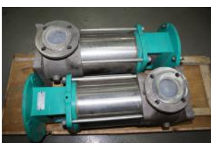
Reference: BPS-029 WATER PUMP Year: . Brand: WILO