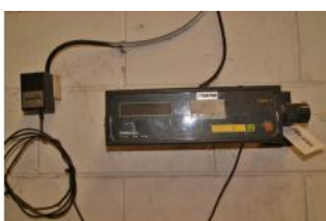
Reference: FSV-108 SCALES Year: . Brand: PRECIA