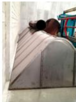
Reference: COT-001 FUME HOOD Year: . Brand: .