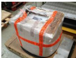
Reference: BPS-076 TRANSFORMER Year: . Brand: SBA-TRAFOTECH