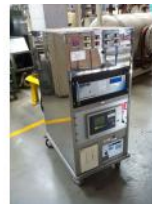
Reference: BPS-038 SMOKE CONTROL SYSTEM Year: . Brand: UHP-ATC