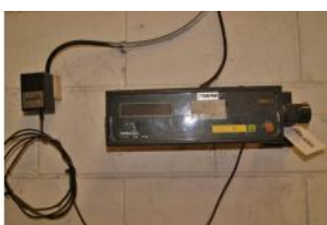
Reference: FSV-108 SCALES Year: . Brand: PRECIA