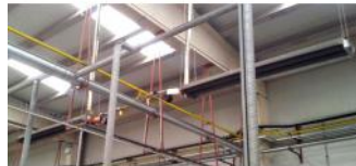
Reference: MOL-069 GAS HEATING RADIANT TUBE Year: . Brand: .