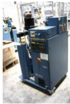
Reference: BPS-095 BULK MELTER Year: 2002 Brand: NORDSON