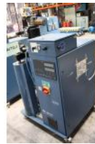
Reference: BPS-094 BULK MELTER Year: 2001 Brand: NORDSON