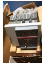
Reference: BPS-078 SWITCH Year: . Brand: ABB