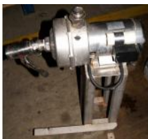
Reference: FSV-147 WATER CIRCULATION PUMP Year: . Brand: .