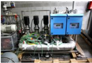
Reference: BPS-025 3 GROUP PUMPS WITH 2 GROUP UV ... Year: CRN 10-05 A-FGS-G-E-HQQE Brand: GRUNDFOS