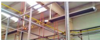
Reference: MOL-068 GAS HEATING RADIANT TUBE Year: . Brand: .