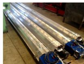
Reference: LIC-008 GAS HEATING SYSTEM BY RADIANT TUBE Year: 2006 Brand: CARLIEUKLIMA