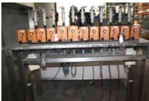
Reference: BPS-066 PUMP GROUP Year: . Brand: PROMINENT