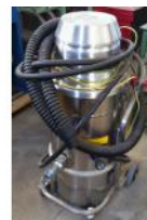
Reference: BPS-022 VACUUM PNEUMATIC ATEX Year: 2008 Brand: NILFISK