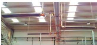
Reference: MOL-070 GAS HEATING RADIANT TUBE Year: . Brand: .