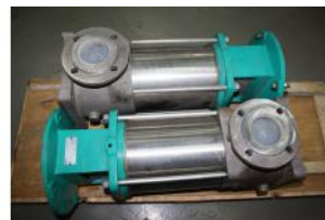
Reference: BPS-028 WATER PUMP Year: . Brand: WILO