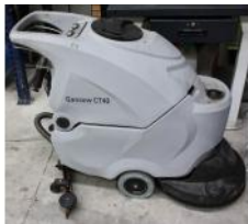
Reference: BPS-064 SCRUBBER - VACUUM CLEANER Year: . Brand: GANSOW