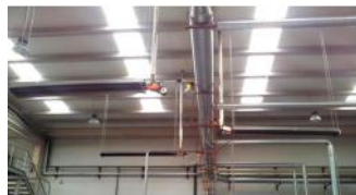
Reference: MOL-071 GAS HEATING RADIANT TUBE Year: . Brand: .