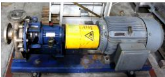
Reference: BPS-071 PUMP Year: . Brand: ITUR