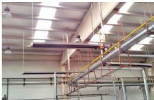
Reference: MOL-066 GAS HEATING RADIANT TUBE Year: . Brand: .