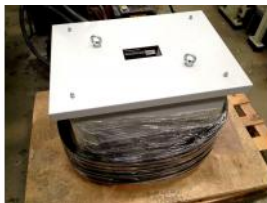
Reference: BPS-074 TRANSFORMER Year: . Brand: SBA-TRAFOTECH