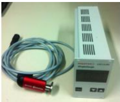
Reference: BPS-135 PFEIFFER VACUUM Year: . Brand: PFEIFFER