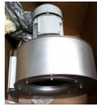
Reference: BPS-077 FAN Year: 2003 Brand: SODECA