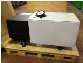
Reference: BPS-027 VACUUM PUMP Year: 2005 Brand: OERLIKON