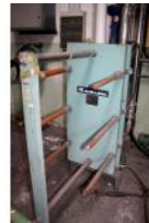
Reference: LUI-024 HEAT EXCHANGER Year: 1981 Brand: ALFA-LAVAL