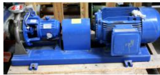
Reference: BPS-070 PUMP Year: . Brand: ITUR