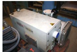
Reference: BPS-037 PUMP SUCTION Year: 1999 Brand: PFEIFFER