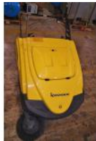
Reference: MOL-017 SWEEPER ELECTRIC BATTERY Year: 2005 Brand: KRÜGER