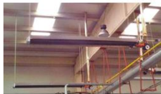
Reference: MOL-067 GAS HEATING RADIANT TUBE Year: . Brand: .