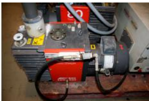
Reference: BPS-034 VACUUM PUMP Year: . Brand: ROC EDWARDS