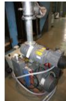
Reference: BPS-033 VACUUM PUMP Year: . Brand: ROC EDWARDS