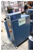
Reference: BPS-093 BULK MELTER Year: 2000 Brand: NORDSON