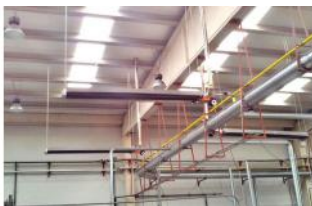
Reference: MOL-066 GAS HEATING RADIANT TUBE Year: . Brand: .