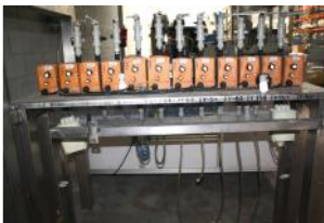
Reference: BPS-066 PUMP GROUP Year: . Brand: PROMINENT