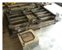
Reference: LUI-009A SCALES PLATFORM Year: . Brand: .