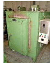
Reference: MOL-026 OVEN Year: . Brand: BERTAM