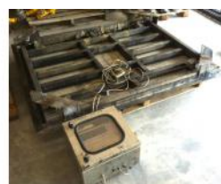
Reference: LUI-009A SCALES PLATFORM Year: . Brand: .