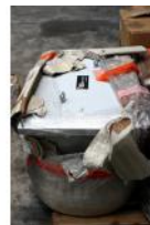
Reference: BPS-075 TRANSFORMER Year: . Brand: SBA-TRAFOTECH