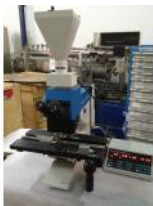
Reference: BPS-092 MICROSCOPE Year: . Brand: .