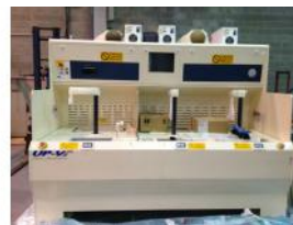
Reference: BPS-081 SEMI-AUTOMATIC WET PROCESS STATION Year: . Brand: AKRION