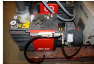
Reference: BPS-034 VACUUM PUMP Year: . Brand: ROC EDWARDS