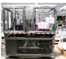
Reference: BPS-080 SOLAR WAFER HANDLING SYSTEM Year: 2002 Brand: ATS