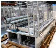
Reference: BPS-082 CELL TESTER 02 Year: 2005 Brand: NPC INCORPORATED