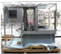
Reference: BPS-035 MACHINE WITH ROBOT Year: 2006 Brand: MONDRAGON