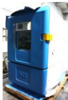
Reference: BPS-024 CLIMATIC CHAMBER Year: 2006 Brand: ANGELATONI