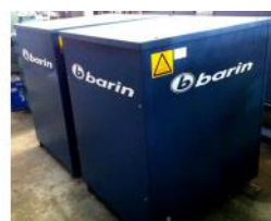
Reference: BPS-016 HIGH PRESSURE VACUUM DRAWER FO... Year: . Brand: BARIN