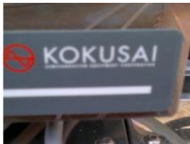
Reference: BPS-100 EMITTER DIFFUSION Year: . Brand: BTU / KOKUSAI