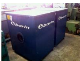
Reference: BPS-015 HIGH PRESSURE VACUUM DRAWER FO... Year: . Brand: BARIN