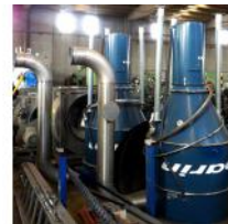
Reference: BPS-013 CYCLONE WITH ELECTRONIC PROBES ATEX Year: 2007 Brand: BARIN