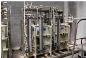
Reference: BPS-085 GROUP OF 3 TANKS ON STAINLESS ... Year: . Brand: .