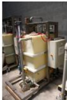
Reference: BPS-089 GROUP OF 1 TANK ON STAINLESS S... Year: . Brand: .