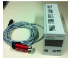
Reference: BPS-135 PFEIFFER VACUUM Year: . Brand: PFEIFFER