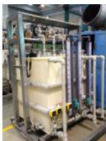
Reference: BPS-088 GROUP OF 3 TANKS ON STAINLESS ... Year: . Brand: .