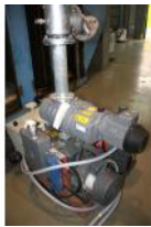
Reference: BPS-033 VACUUM PUMP Year: . Brand: ROC EDWARDS