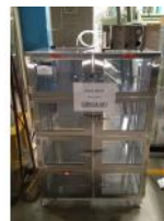
Reference: BPS-097 DEHUMIDIFIER CAMERA Year: . Brand: TERRA UNIVERSAL