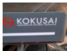
Reference: BPS-099 EMITTER DIFFUSION Year: . Brand: BTU / KOKUSAI