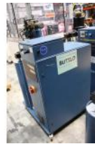
Reference: BPS-093 BULK MELTER Year: 2000 Brand: NORDSON