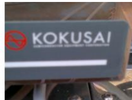
Reference: BPS-101 EMITTER DIFFUSION Year: . Brand: BTU / KOKUSAI