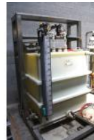
Reference: BPS-090 GROUP OF 1 TANK ON STAINLESS S... Year: . Brand: .