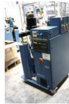
Reference: BPS-095 BULK MELTER Year: 2002 Brand: NORDSON