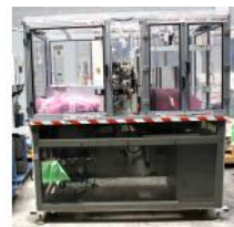
Reference: BPS-079 SOLAR WAFER HANDLING SYSTEM Year: 2002 Brand: ATS