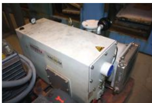
Reference: BPS-037 PUMP SUCTION Year: 1999 Brand: PFEIFFER