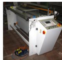
Reference: BPS-043 GUILLOTINE BLADES FOR PLASTIC,... Year: 2005 Brand: ROBUST