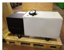
Reference: BPS-027 VACUUM PUMP Year: 2005 Brand: OERLIKON