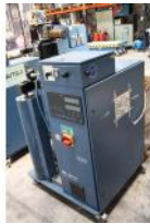
Reference: BPS-094 BULK MELTER Year: 2001 Brand: NORDSON