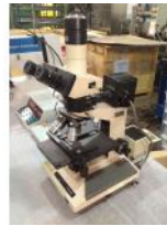
Reference: BPS-091 MICROSCOPE Year: . Brand: .