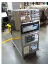
Reference: BPS-038 SMOKE CONTROL SYSTEM Year: . Brand: UHP-ATC