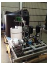
Reference: BPS-073 GROUP WITH 2000 LTS. PLASTIC T... Year: . Brand: GRUNDFOS