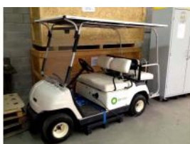
Reference: BPS-084 ELECTRIC CAR Year: 2001 Brand: YAMAHA