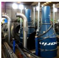
Reference: BPS-014 CYCLONE WITH ELECTRONIC PROBES ATEX Year: 2007 Brand: BARIN