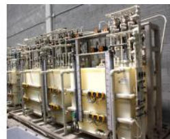
Reference: BPS-086 GROUP OF 4 TANKS ON STAINLESS ... Year: . Brand: .