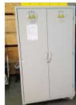
Reference: BPS-096 CHEMICAL CABINET Year: 2006 Brand: GS