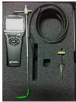
Reference: BPS-142 MICROMANOMETER Year: . Brand: AIRFLOW