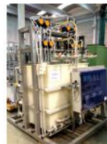
Reference: BPS-087 GROUP OF 3 TANKS ON STAINLESS ... Year: . Brand: .